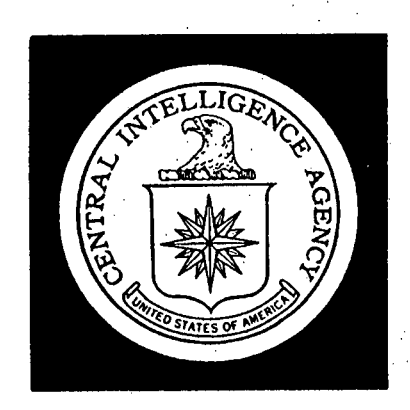
DIRECTORATE OF INTELLIGENCE

EO 12958 3.3(b)(1)>2 EO 12958 3.3(b)(6)>2 EO 12958 6.2(c)